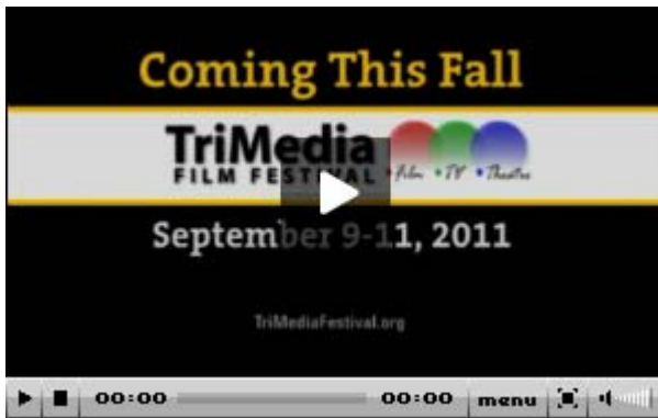
TriMedia Film Festival Promo